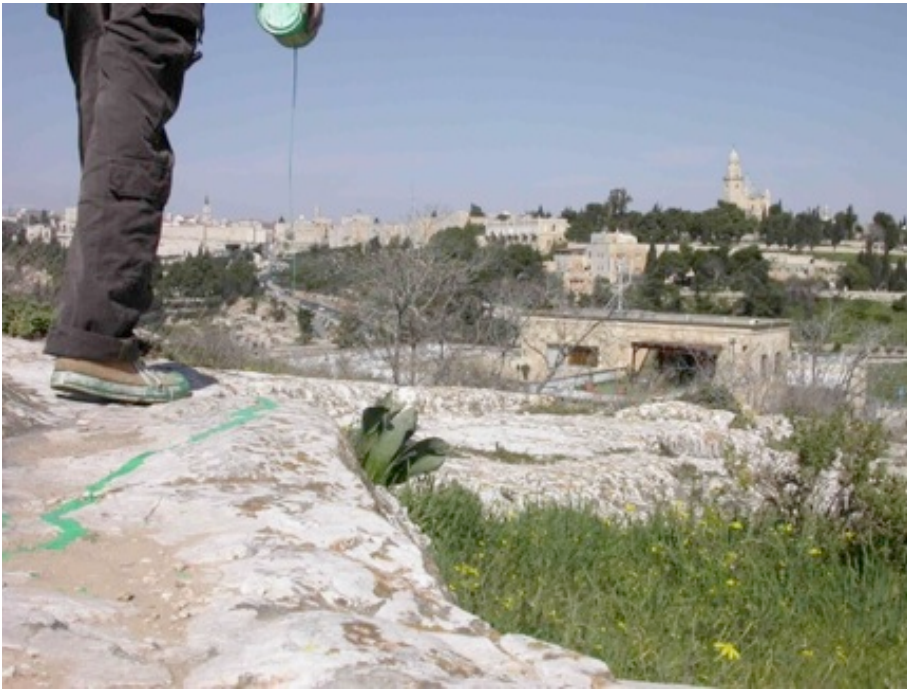
Francis Alÿs, The Green Line , 2004. Video documentation of an action.